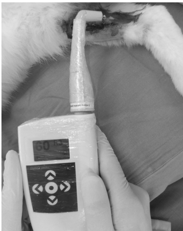
Figure 3 Orthodontic miniscrew stability was monitored using resonance frequency analysis (Ostell; Integration Diagnostics AB) device.

corresponding implants were inserted by prefabricated distance holders in a standard distance of 15 mm.