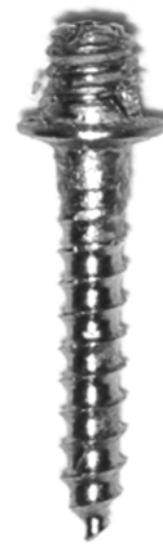
Figure 1 Screw-shaped titanium orthodontic miniscrews with a length of 8 mm and a diameter of 1.4 mm (Dual Tops; Jeil Medical Corporation).

A total of fifteen, 8-month-old New Zealand white adult male rabbits weighing 3000–3500 g were used for the study.